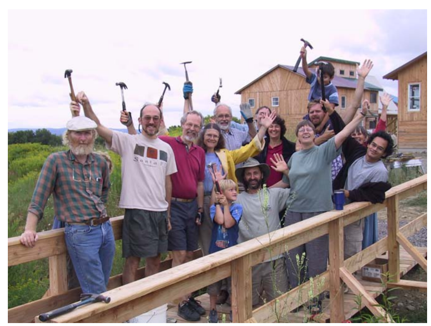
Residents from FROG and SONG celebrate building a bridge between the two neighborhoods. This can-do, cooperative spirit is a key part of the success of EcoVillage at Ithaca.

Meanwhile, the existing village is able to demonstrate using approximately 40% fewer resources than typical American households, and when the new neighborhood, TREE is built, it is expected to demonstrate 90% less energy use for heating the homes. There are many lessons to be learned from this integrated model for housing, green building, food production, and much more.