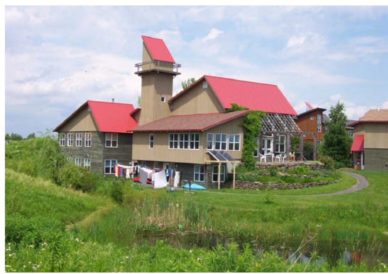
FROG Common House, a community center serving 30 households, with common laundry, dining and kitchen facilities, play areas, living room, and 8 "home" offices.

In November, 1996, in the midst of the building process, when half of the homes were finished (with eight occupied), and another half were underway, a major construction fire broke out. In one of the largest fires in the history of Ithaca, flames shot 60' high, and demolished 8 houses, the Common House, and damaged six other homes. It was terrifying! Luckily the Ithaca Fire Department and five volunteer fire departments from nearby towns came to the rescue, and the rest of the neighborhood was saved. Also, we were lucky that builder's risk insurance covered the cost of rebuilding all of the damaged homes. FROG was rebuilt, and a celebration was held in the new Common House in August, 1997.