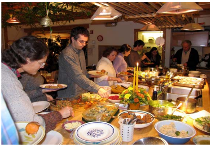
Dinner at the Common House provides delicious home-cooked food and a chance for residents to socialize.

Our community enjoys lots of seasonal celebrations such as "Guys Baking Pies" when the men and boys pick wild blackberries and make dozens of pies for a community party. We also have an annual Easter Egg hunt, celebrate Channukah with potato latkes, and have an annual Strawberry Solstice party. These are just a few of our many community parties.