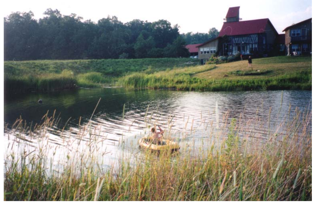
The one acre swimming pond is just one of many shared amenities for residents and visitors.

It is interesting to note that many of the shared amenities (such as FROG's district heating or the new 50 KW solar system, or use of the woodshop or work-out rooms, or community meals) count on a well-organized system for accounting and billing residents.