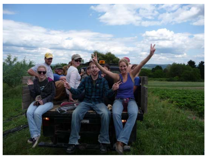
Groundswell beginning farmer training students on their way to working at West Haven Farm.

Current educational activities center on teaching young people important food and farming skills through Groundswell Center for Local Food and Farming <a href="www.groundswellcenter.org">www.groundswellcenter.org</a>, applying lessons learned to residential development through the Climate Showcase Communities grant (in collaboration with Tompkins County Planning Department), and ongoing collaborative courses, and faculty development through our Partnership for Sustainability Education with Ithaca College. In addition, we write books, enjoy ongoing national and international media attention, and host tours for visitors from around the world.