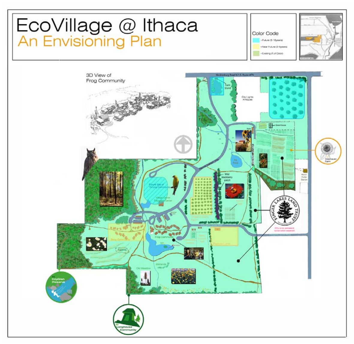
<u>Land Use Contrast:</u> In this Envisioning Plan, 90% of the entire site is set aside for farms, woods, ponds and meadows, with just 10% for 100 homes, Common Houses, and parking. The prior developer's plan called for 90% of the site for developing 150 homes, with just 10% open space – a typical suburban subdivision.

Joan and I raised $400,000, primarily in loans, from friendly investors around the country in a matter of weeks. The legal structure took months to figure out, however. A structured mortgage pool of 9 investors was created, with one individual mortgage on an adjacent parcel. We closed on the land on the summer solstice, June 21, 1992, just a year after the Envisioning Retreat.