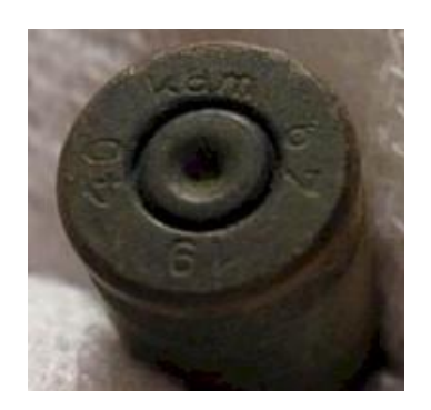
Shells of the type found in graves No. 1 and 2 (From Strygin's article cited in note 1.)

The Polish, but not the Ukrainian, report also specifies the shells found in grave No. 2: