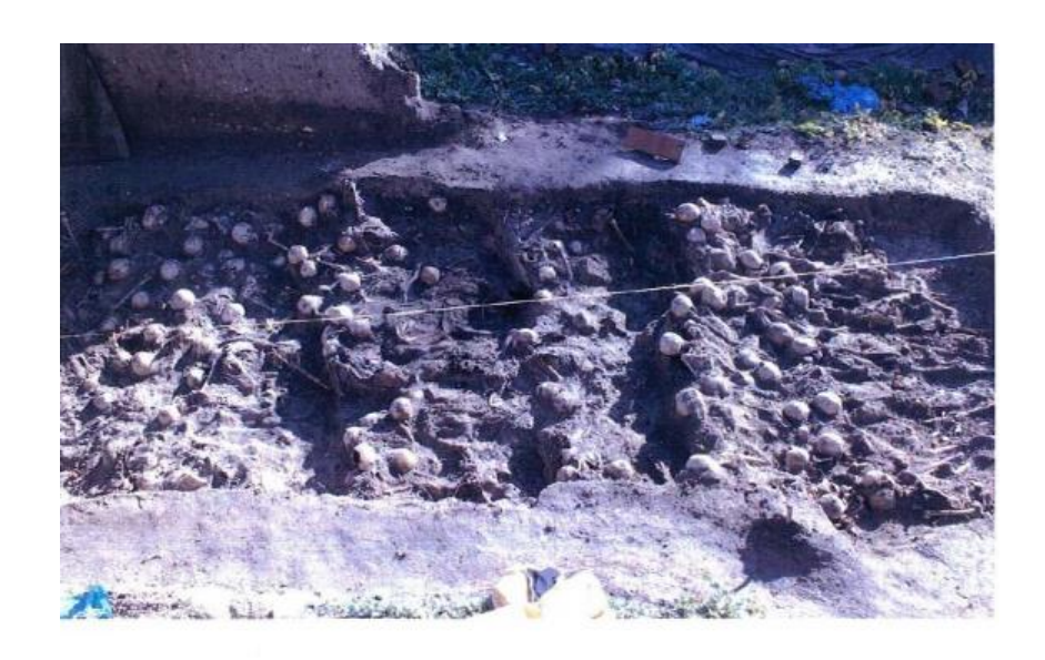
Włodzimierz Wołyński 2012. Szkielety w grobie nr 1, widoczne 4 kolejne grupy