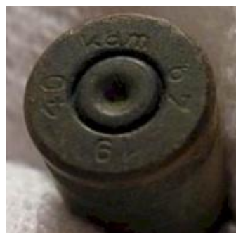
Shells of the type found in graves No. 1 and 2 (From Strygin's article cited in note 1.)

The Polish, but not the Ukrainian, report also specifies the shells found in grave No. 2: