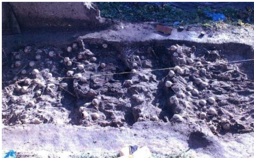
Włodzimierz Wołyński 2012. Szkielety w grobie nr 1, widoczne 4 kolejne grupy