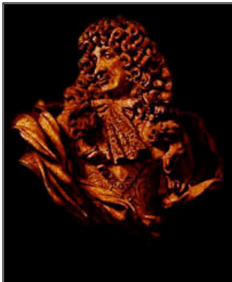
Charles II, King of England, who bestowed a knighthood on one of the world's most formidable rascals.