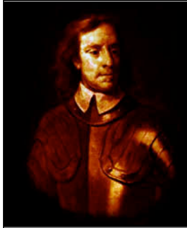
Oliver Cromwell, Lord Protector of England and her Commonwealth.

Later, as England's Puritan Ruler Oliver Cromwell sent forward an army to the Caribbean under the command of General Venables to attack the Spaniards, Henry in early 1655 joined this army to escape his indenture on the island. The other version says Morgan joined General Venables' troops in 1654 as a volunteer at Plymouth. Either way, Henry Morgan joined up with Venables' forces.