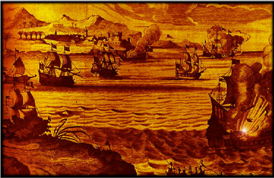
The battle between Henry Morgan and Don Alonso at Maracaibo

After eight unsuccessful weeks in the Lagoon of Maracaibo he sailed back for Maracaibo itself. There he was to famously meet at sea with Vice-Admiral Alonso del Campo y Espinosa, who commanded three powerful men-o-war. On 1 May 1669 the battle took place whereby Morgan's buccaneers sailed a fireship (a ship purposely set alight) into the Vice-Admiral's 48-gun ship Magdalen . The Magdalen burnt and sank, the Santa Louisa fled and the Marquesa , the third Spanish ship, was captured by the buccaneers.