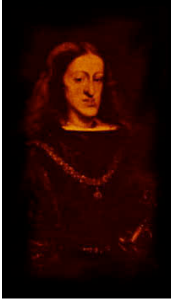
Carlos II, the ailing King of Spain to succeed Philip IV in 1665.