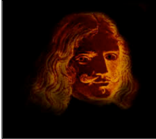
Captain Henry Morgan (1635-1688)

What must first be made clear is that Henry Morgan was not a pirate. A rogue maybe, but not a pirate. He was a privateer. This meant he held a paper issued by a representative of the English government, the governor of Jamaica, empowering him to fight the Spaniards on England's behalf. His pay was in effect what he managed to steal from Spain.