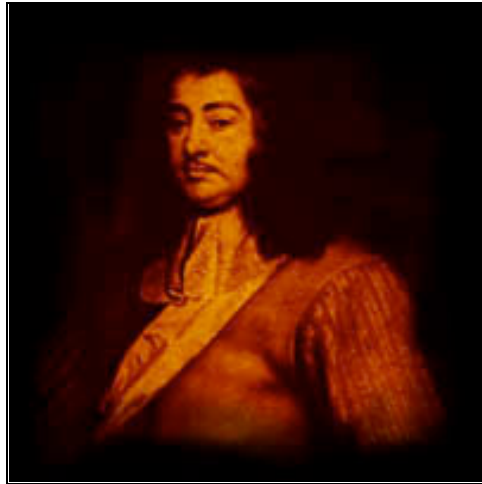
George Monck, Duke of Albermarle, ally of Henry Morgan.

On 6 March Morgan was back in Port Royal. But never again was he to be the infamous pirate, far more the respectable man of power and status. He soon settled down to life in the island's council, overseeing the defences and of course expanding his fortunes as a rich sugar planter.