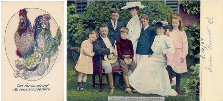
Fig. 2 Race suicide post card images from the first decade of the 1900s. http://postcardy.blogspot.com/2009/05/race-suicide-motherhood-and-theodore.html

life pitilessly screened out the weak and debilitated, leaving only the hardy and vigorous” (in Lovett 2007, p. 89). Losing the frontier, the “weak and debilitated” were now able to survive in the cities and even virile others were apt to succumb to urban decadence. Ross suggested that models based on the “natural” control and order of the frontier would provide “social” control and order for the new American population. Among the social controls Ross proposed was a regulated system for reproduction ensuring only those most fit were given ample opportunity to reproduce.