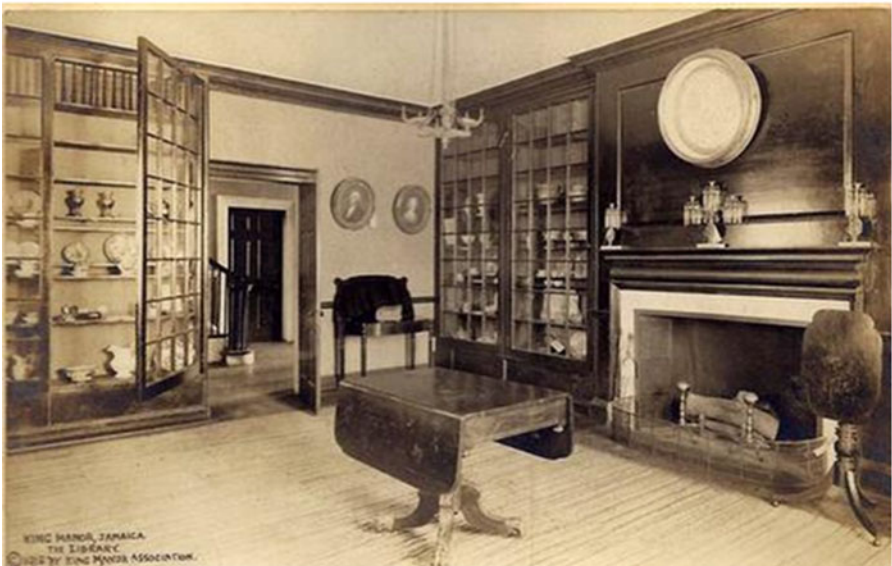
Fig. 4 Photographs showing decorated rooms at King Manor Museum in the 1910s

of Anglo-Saxon American norms embodied by the patriotic King family, other historic figures like the Washingtons, the modern museum directors, and their peer organizations. These associations combined to set King Manor apart from its surrounding urbanizing community, which since 1890 was rapidly growing to be home to a much more diverse population. As a whole, the Queens County population grew from 90,000 to 153,000 between 1880 and 1900, much of which is accounted for by foreign born immigrants who doubled in number from 21,000 to 44,000 in