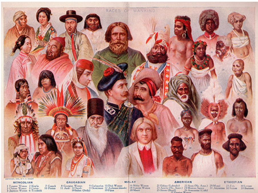
Fig. 1 Races of mankind, Webster's Dictionary, 1911.